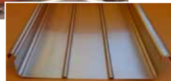
Bemo 305mm .040 Aluminum

Contact: Bemo USA for our corporate videos, latest specifications and design help. 1-800-926-2366 www.BemoUSA.com