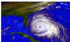
EXTREME NOA LOAD RATING -219.6psf

School Districts across Florida rely on Bemo Structural Standing Seam to provide the performance demanded at a price that is competitive: Volusia County, St. John's County, Hillsborough County, Bay County, Broward County . . .